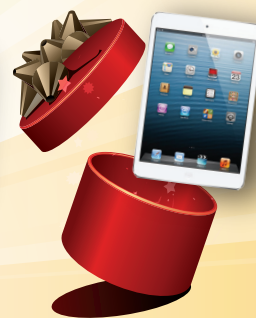
Apple iPad mini, 16GB Wifi

Contact your Product Specialist for more details. Offers valid for signups before 31st Dec 2013 , act now!