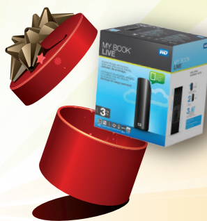
WD MyBook Live, 2 TB