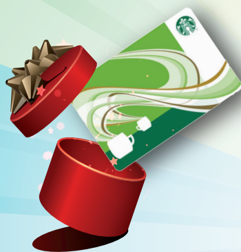
Starbucks Card worth RM40