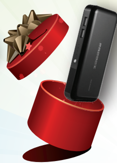
Sanyo PROBOX Portable Power Pack with 10400 mAh Li-ion battery