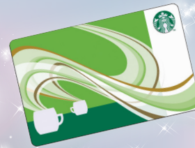
Starbucks Gift Card

Contact your Product Specialist today for details.