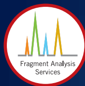
Fragment Analysis Services