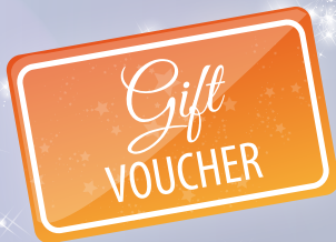
F & B Voucher