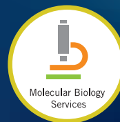
Molecular Biology Services

For orders and enquiries, please contact us: