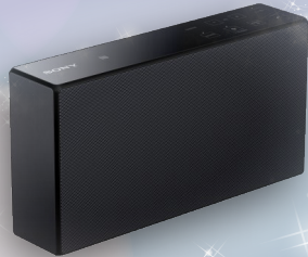
Sony SRS-X55 Wireless Speaker