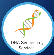
DNA Sequencing Services