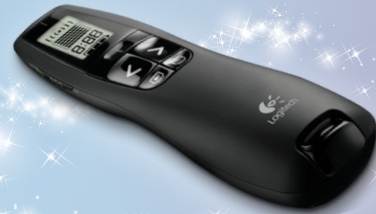
Logitech Professional Presenter R800