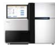
HiSeq2000 / 2500