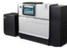
PacBio RS II