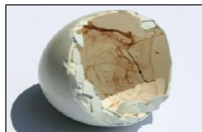
Figure 3: Example of eggshell that is ready for PCR test.