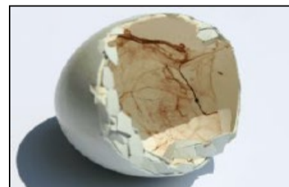
Figure 3: Example of eggshell that is ready for PCR test.